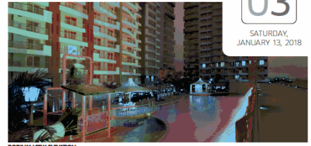
POOL VIEW ELEVATION