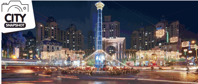
WINTER RESTA: The festive lights illuminated on the arrival of New Year is an event that celebrates light over darkness and promotes 'love and happiness' in the vibrant community of Hirandandari Gardens, Powai