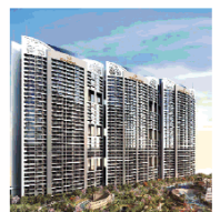
Sai World Empire: Phase-1 RERA P5700002446

Paradise Group's Sai World Empire is a magnificent project comprising of 6+ 38-storied towers inspired by the world's six greatest empires and the lifestyles of their ruling kings and queens. Offering 2, 3 and 4-BHK imperial luxury homes with themed lifestyle features, Sai World Empire is the perfect example of royal experiences of yesteryears blending perfectly with modern lifestyle of the present. Perfect for high style living experiences, this elegant project is situated in the heart of Kharghar.