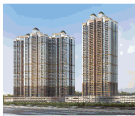
Sai World City: Phase-1 RERA P52000006318

Planned and designed for the fortunate ones, Sai World City is a global living experience that will entertain and entice its residents in every way. This magnificent township at Panvel, inspired by the landmarks and lifestyles of famous world cities comprises of 2, 3 and 4-BHK cosmo-luxury homes with advanced luxury interiors from across the globe. With acres of open green spaces, themed landscaping and a lavish club life with world's best health, recreation and leisure amenities, Sai World City has become the ultimate choice for many residents who want to experience a truly global lifestyle very close to the futuristic conveniences of Navli Mumbai. Located at the fast-growing city of Panvel with upcoming Navli Mumbai International airport just 5 minutes away, Sai World City has become the most sought-after luxury landmark for many.