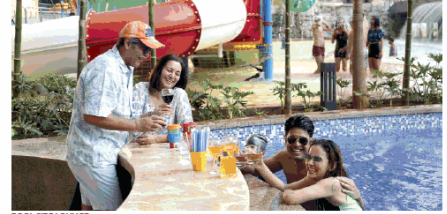
POOL SIDE LOUNGE