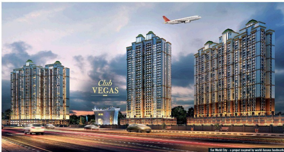
Sai World City - a project inspired by world famous landmarks

Navi Mumbai's most prestigious themed project, Sai World City Phase 1, is nearing completion