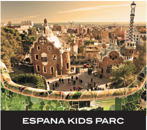
ESPANA KIDS PARC