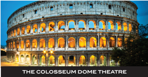
THE COLOSSEUM DOME THEATRE