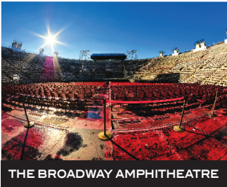
THE BROADWAY AMPHITHEATRE

For details, contact: 022 2783 1000 Site Address: Sai World Empire, Opp. Kharghar Valley Shilp (CIDCO Colony), Kharghar Corporate Office: 1701, Satra Plaza, Plot No. 19 & 20, Sector - 19D, Vashi, Navi Mumbai - 400 705